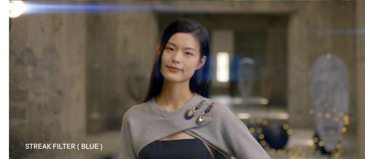
STREAK FILTER ( BLUE )

Flexible and controllable, just for your creative filming. Long blue anamorphic streak effect simulated in strong light. Boost the technical sense on the image.