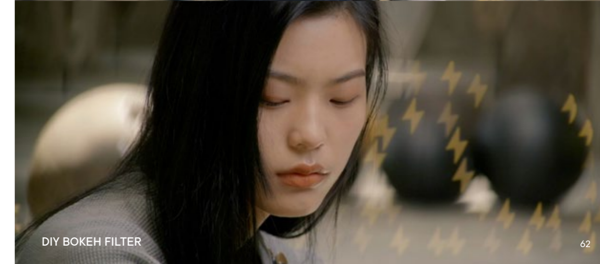
DIY BOKEH FILTER

Unlock the game of Vespider Prime and Catta Ace Zoom (PL mount), and free your creativity. DIY Bokeh, adding flares, lower the sharpness... Magnetic filter frame+ Bokeh Filter, the secret to unique bokeh. Start with D logo, Star, Lighting, Heart and Question Mark filters in the package.