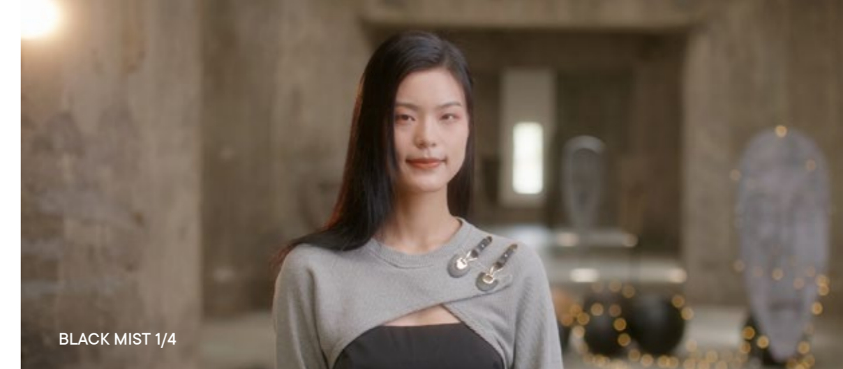
BLACK MIST 1/4

Reserve more shadow details while softening the light.